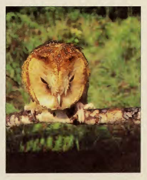
Head on portrait of Congo Bay Owl, Phodilus prigoginei Itombwe, May 1996